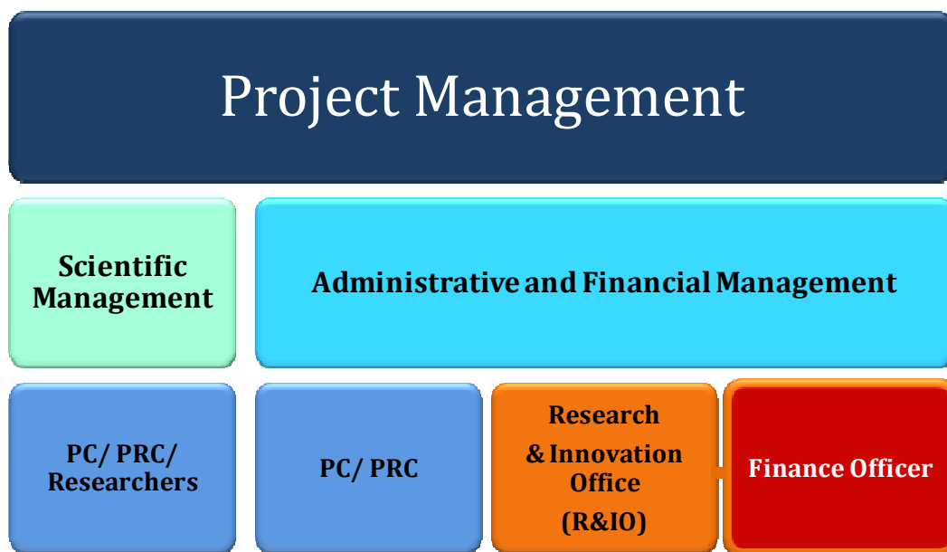
Figure 1: Project Management Collaboration

The management of funded projects consists of scientific, administrative, and financial activities. The scientific activities of a project are the sole responsibility of the Project Coordinator (PC) 1 or the Partner Research Coordinator (PRC) 2 and associated Researchers involved in the project (Fig.1). The administrative and financial activities require the collaboration of the PC/PRC with the R&IO and the Finance Officer (FO) (who will work in close collaboration with the University's Finance Department) (Fig.1). Good collaboration is necessary in order for the projects to be carried out and completed successfully.